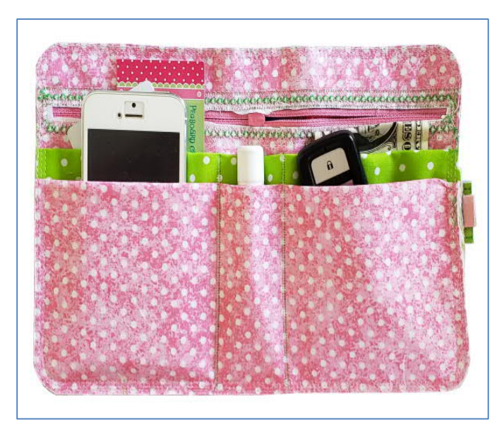
OMA Rosa - Inside